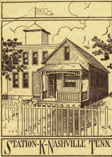
(Our New Suburban Office.)