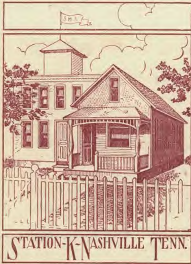
(Our New Suburban Office.)